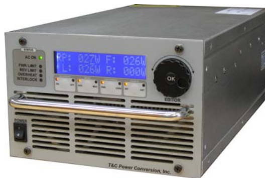
Power Supply Front Panel View

Generator Model AG 0313 is a robust source of RF power for laser modulation, plasma generation, general laboratory and general industrial applications. Featuring leading edge solid state design for all generator stages, it provides everything for a complete and reliable, controlled RF power delivery system. It reflects the T&C ongoing commitment to provide RF power products of the highest quality, incorporating the current requirements for complete remote control and data acquisition features