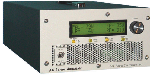
Power Supply Front Panel View

Amplifier/Generator AG 1006 is a robust source of RF power for ultrasonic, laser modulation, RFI/EMI, plasma generation, laboratory and general industrial applications.