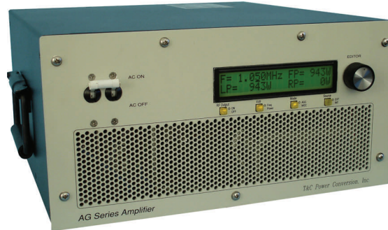
Power Supply Front Panel View

Amplifier Model AG 1012 is a robust source of RF power for ultrasonic, laser modulation, RFI/EMI, plasma generation, laboratory and general industrial applications.