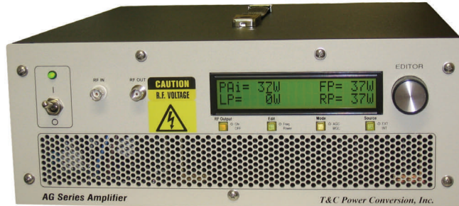
Power Supply Front Panel view

Model AG1021 is a robust source of RF power for ultrasonic, laser modulation, RFI/EMI, plasma generation, general laboratory and general industrial applications.