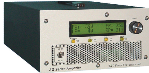
Power Supply Front Panel view

Model AG 1014 Amplifier/Generator is a robust source of RF power for ultrasonic, laser modulation, RFI/EMI, plasma generation, general laboratory and industrial applications.