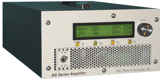
Power Supply Front Panel view

Model AG 1016 Amplifier/Generator is a robust source of RF power for ultrasonic, laser modulation, RFI/EMI, plasma generation, general laboratory and industrial applications. Featuring leading edge solid state design in all RF amplifier stages and a built-in DDS signal source, it provides everything for a complete and reliable, finely controlled RF power delivery system. It reflects the T&C ongoing commitment to provide RF power products of the highest quality, incorporating the current requirements for complete remote control and data acquisition features.