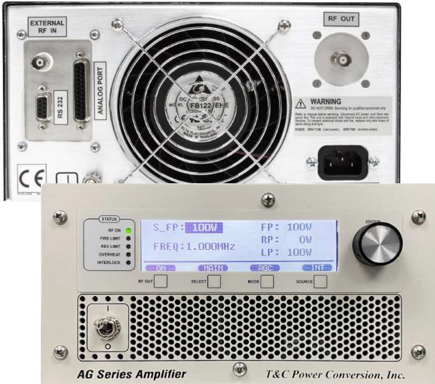
▲ AG 1021 (front and rear panels)