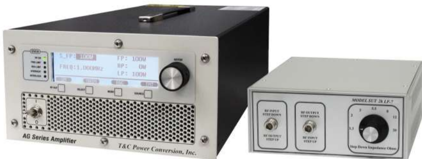
▲ Complete RF system (AG power source and T1K impedance matching transformer)