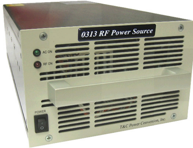
RF Power Source Front Panel view

RF Power Source Model 0313 is a robust source of RF power for laser modulation, plasma generation, general laboratory and general industrial applications.