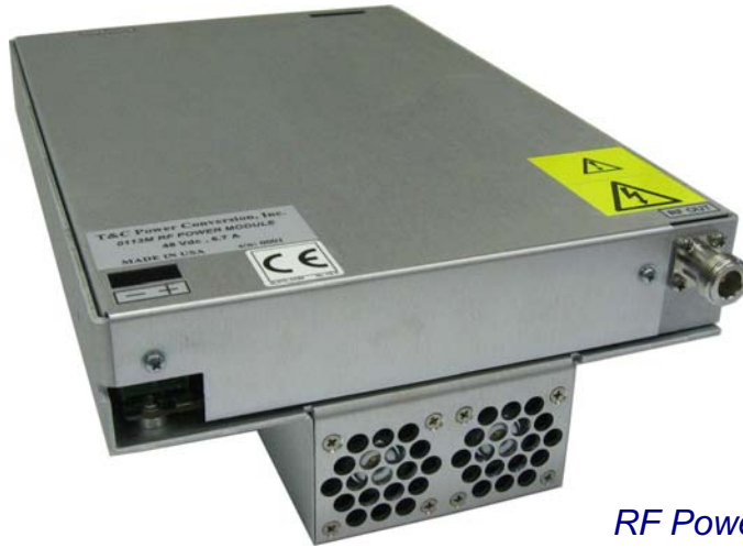
RF Power Module

RF Power Module 0113M is a robust source of RF power for laser modulation, plasma generation, general laboratory and general industrial applications.