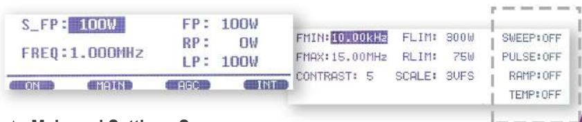
▲ Main and Settings Screens (with Ramp, Sweep, Pulse profiles)