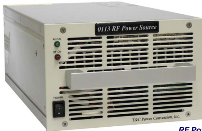
RF Power Source Front Panel view

RF Power Source Model 0113 is a robust source of RF power for laser modulation, plasma generation, general laboratory and general industrial applications. Featuring leading edge solid state design for all generator stages and a built-in DDS signal source, it provides everything for a complete and reliable, controlled RF power delivery system. It reflects the T&C ongoing commitment to provide RF power products of the highest quality, incorporating the current requirements for complete remote control and data acquisition features